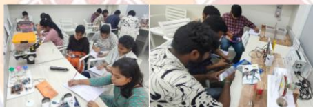
AICTE IDEA LAB