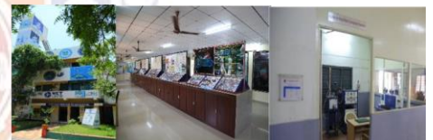
CENTRES OF EXCELLENCE