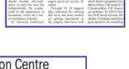
Seminar on Women Empowerment at SRKR Engineering College.

HANS NEWS SERVICE BHIMAVARAM The SRKR Engineering College has organized a seminar on 'Women Empowerment' to highlight the importance of women's education and employment.