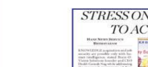
Students working on research projects to uplift rural areas.

EXPRESS NEWS SERVICE BHIMAVARAM Research works in the field of technology and innovation can help uplift rural areas and improve the quality of life.