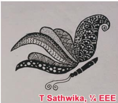
T Sathwika, ¼ EEE