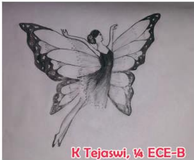
K Tejaswi, ¼ ECE-B