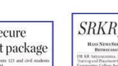
SRKR Engineering College and Lions Club celebrating Women's Day.

EXPRESS NEWS SERVICE BHIMAVARAM The SRKR Engineering College and the Lions Club have celebrated Women's Day with a program of awareness and empowerment.