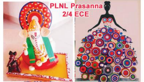
PLNL Prasanna 2/4 ECE