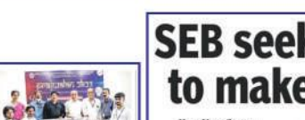
AIC inauguration at SRKR Engineering College.

HANS NEWS SERVICE BHIMAVARAM The Atal Innovation Centre (AIC) has been sanctioned for SRKR Engineering College to promote innovation and entrepreneurship among students.