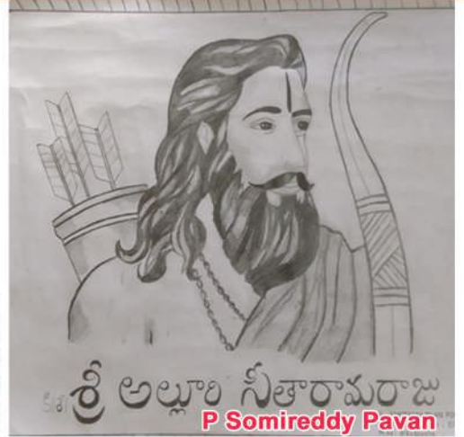
శ్రీ అల్లూరి సీతారామరాజు