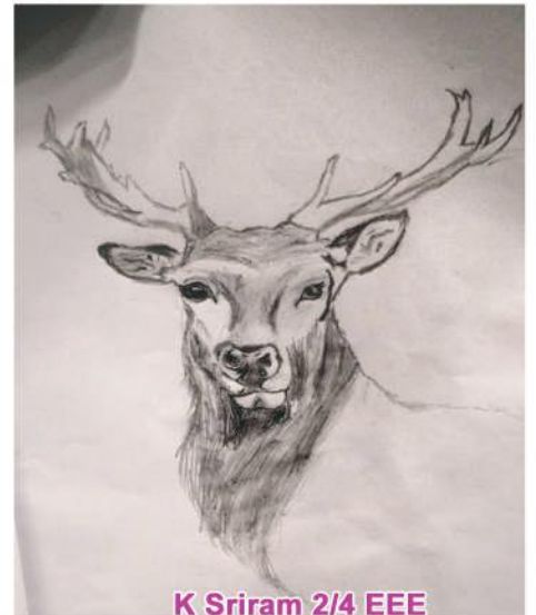
K Sriram 2/4 EEE