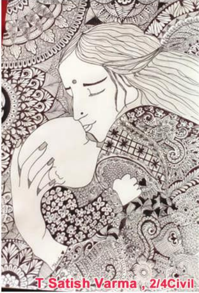
T Satish Varma, 2/4 Civil