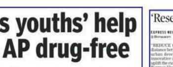
Students working on research projects to uplift rural areas.

EXPRESS NEWS SERVICE BHIMAVARAM Research works in the field of technology and innovation can help uplift rural areas and improve the quality of life.