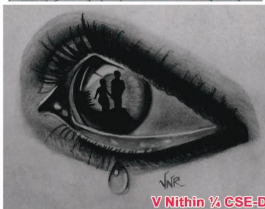
V Nithin ¼ CSE-D