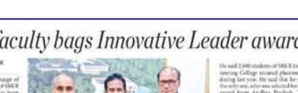
SRKR faculty member receiving an Innovative Leader award.

HANS NEWS SERVICE BHIMAVARAM A faculty member from SRKR Engineering College has been awarded the Innovative Leader award for his contributions to the field of engineering education.