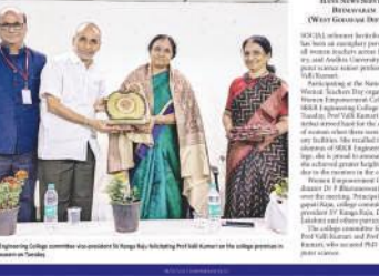
SRKR Engineering College celebrated the 150th birth anniversary of Savitribai Phule on the college premises in Vizagapatnam on Tuesday.