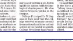
SRKR students receiving job offers for placements.

HANS NEWS SERVICE BHIMAVARAM Two SRKR Engineering College students have secured placements with a salary package of ₹6.5 lakh per annum.