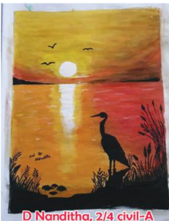
D Nanditha, 2/4 civil-A