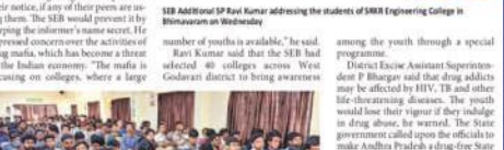
SEB officials addressing students about drug-free Andhra Pradesh.

HANS NEWS SERVICE BHIMAVARAM The Special Enforcement Bureau (SEB) is seeking the help of youths to make Andhra Pradesh a drug-free state.