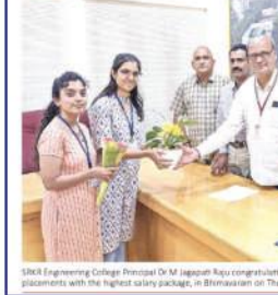
SRKR Engineering College students receiving job offers for placements.

HANS NEWS SERVICE BHIMAVARAM Two SRKR Engineering College students have secured placements with the highest salary package of Rs. 25.5 lakh per annum.