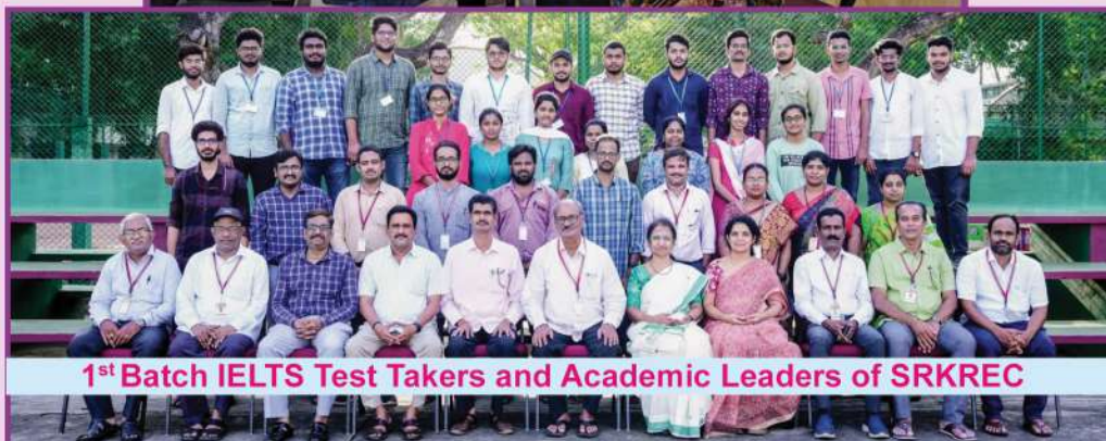
1 st Batch IELTS Test Takers and Academic Leaders of SRKREC