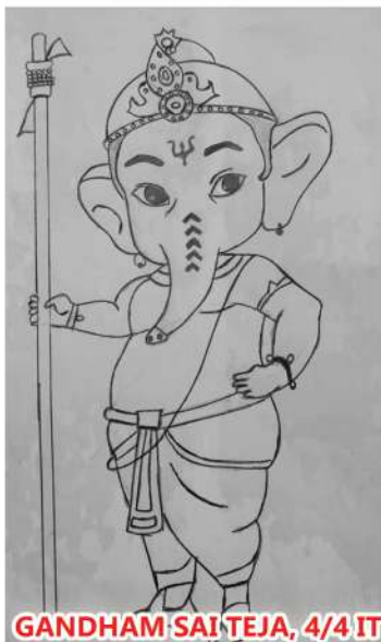
GANDHAM SAI TEJA, 4/4 IT