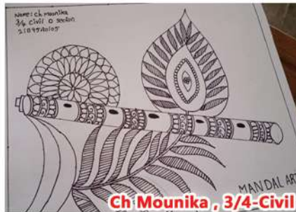
Ch Mounika, 3/4-Civil