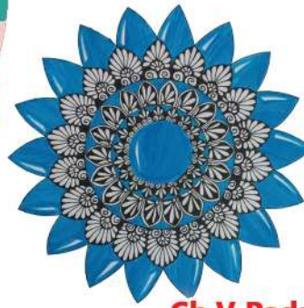
Ch V Padmanjani 3/4-IT