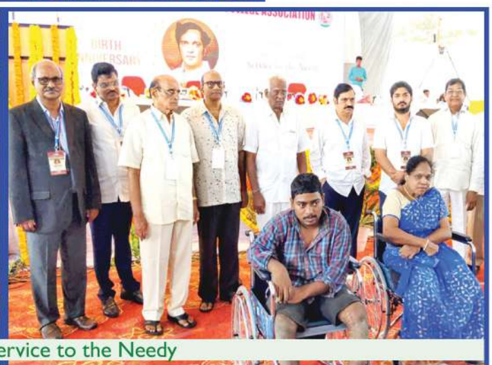
New Initiative : Service to the Needy