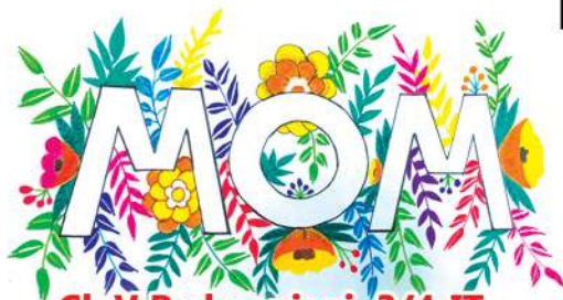
Ch V Padmanjani 3/4-IT